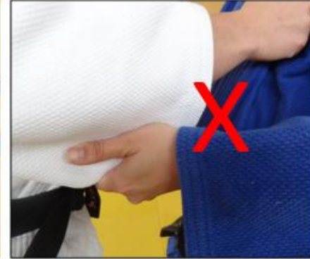
starting position – grip not correct