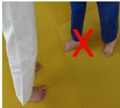
starting position – not correct