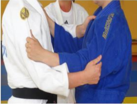
starting position – grip correct