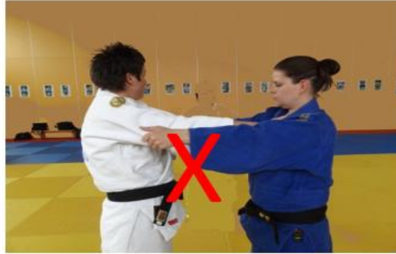
long arms – not correct