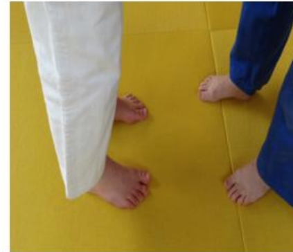
starting position - correct